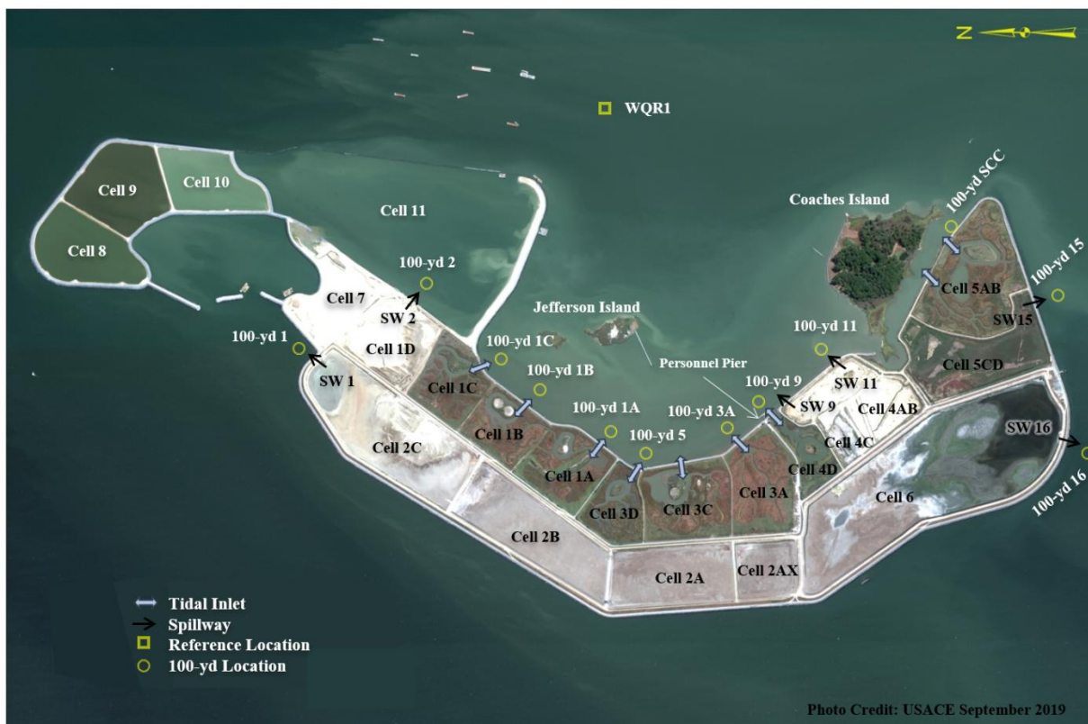
Figure 1. Paul S. Sarbanes Ecosystem Restoration Project at Poplar Island

Throughout 2019, MES Operations raised the Cells 2A and 2B dikes to +30 feet and the Cell 2C dikes to +28 feet, as part of the project's vertical expansion (Figure 1). MES constructed the vertical lifts in segments, increasing the elevation of each segment at one-foot increments. The Cell 2A dike raising was completed in July and the Cells 2B and 2C dike raisings were completed in September. Cell 2AX dike raising was completed in July of 2018. Following the raisings, the interior and exterior dike faces were hydroseeded to avoid leaving them exposed for long periods of time (the exception being the northwest corner of Cell 2C where tern nesting prevented MES from seeding within the allowable growing window). MES removed the stone notches that were constructed for use during the 2018/2019 maintenance material inflow season in order to raise all of the Cell 2 crossdikes to an elevation of +28 feet. Operations staff completed the Cell 6 lower bench raising in July which brings the dike elevation to +25 feet. The newly raised portion was also hydroseeded.